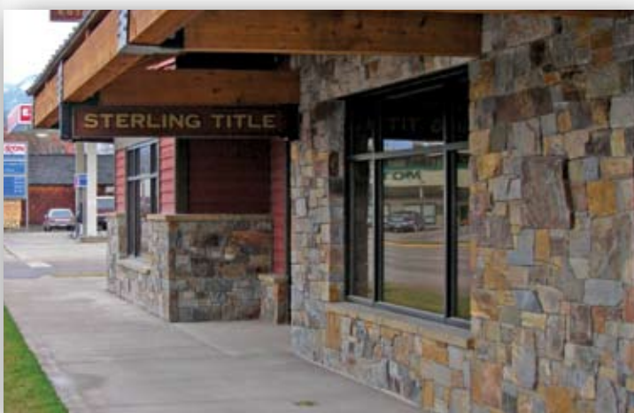
PERMA & CHIEF CLIFF LEDGE MIX