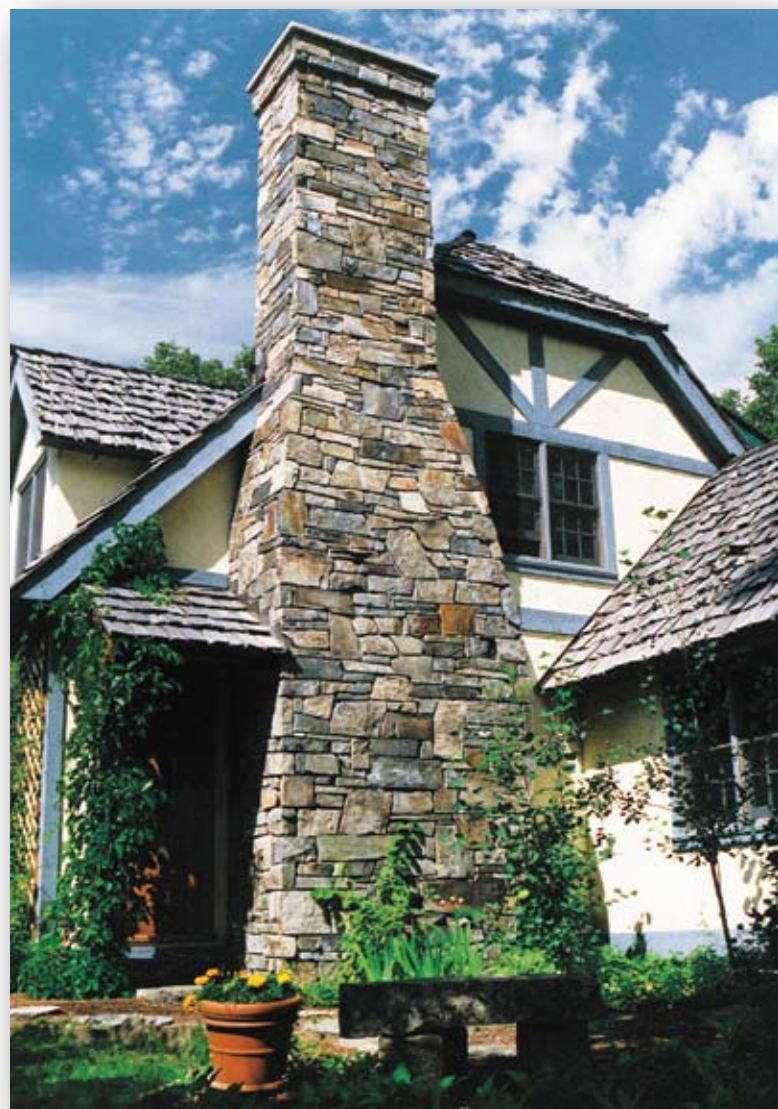
CHIEF CLIFF LEDGE - MONTANA BLEND