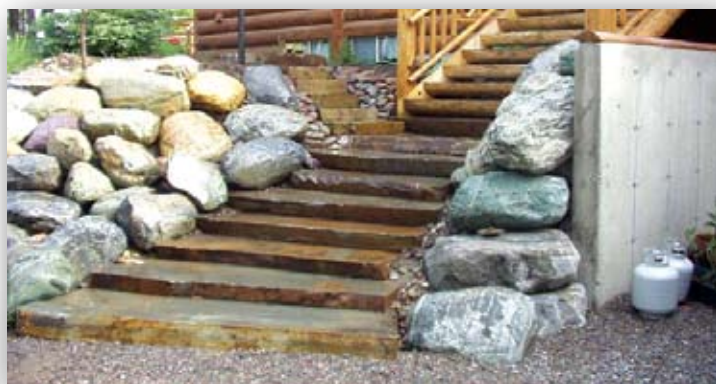
PERMA SLABS & RAINBOW BOULDERS

Our Montana Buildingstone product lines are as diverse as the state they come from. The colors include vibrant reds, oranges, browns and earthy grey tones that blend perfectly with most landscapes. The rustic look and diverse product line makes this product a perfect for an array of applications.