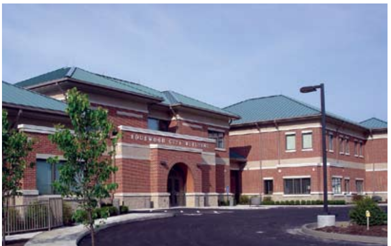
A typical example of today's masonry, the City Building, Edgewood, Ky., features brick, architectural block, precast concrete and manufactured stone. The rules for successful post-construction clean down of such buildings vary from procedures for cleaning buildings of mostly one type of masonry.