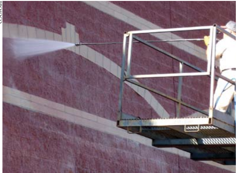
We're not talking garden hose here. Plenty of water, in both the pre-wetting and rinsing steps, is vital to a successful post-construction clean-down of new masonry.