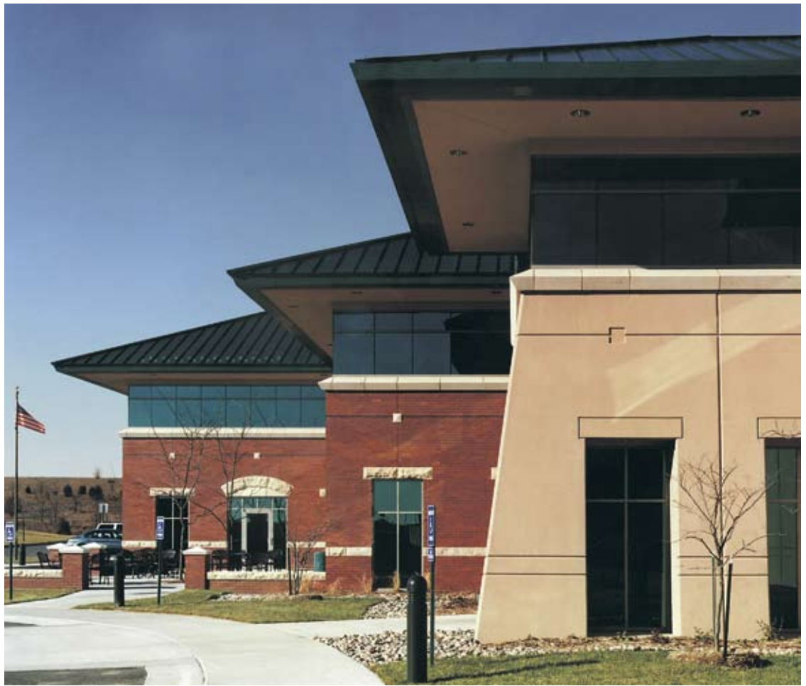
PROSOCO national headquarters, Lawrence, Kansas