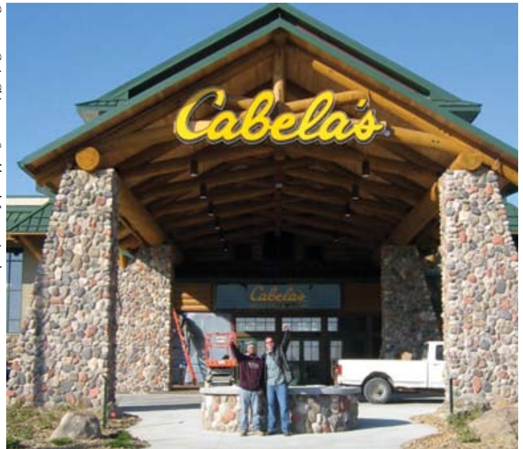
Not all manufactured stones are created equal. Six of the eight colors shown here are integrally colored, and could stand up to a vigorous cleaning. Two of the eight got their color from an applied surface coating that would've been washed out from a vigorous cleaning. The cleaning contractor discovered the difference in testing, and cleaned the building successfully.