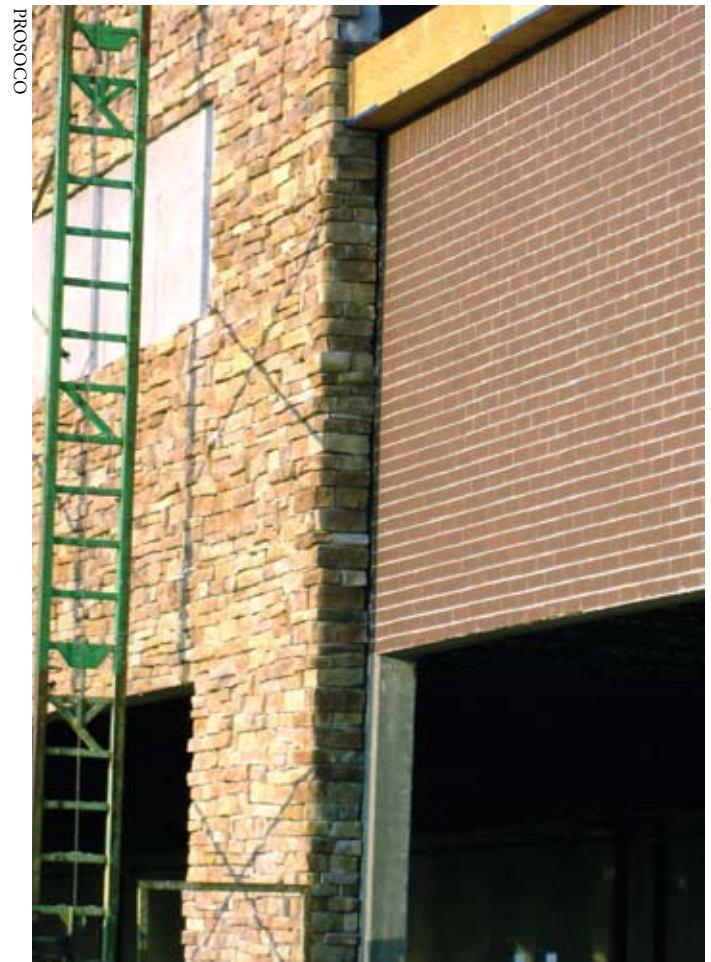
Manufactured stone and clay brick co-exist in this under-construction shopping mall in Olathe, Kan. Different masonry types in the same structure can make post-construction cleandown challenging.

Still others, such as "Know your surface" are new rules for masons brought up in the traditions of "masonry equals brick or block," and "one size fits all" for cleaning them.