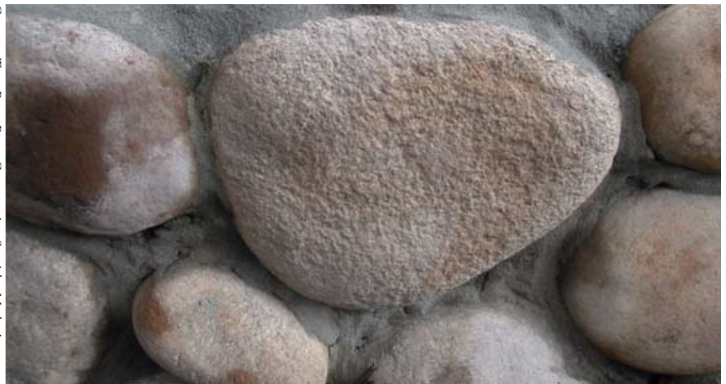
The cleaner was appropriate for clay brick. Unfortunately, the contractor didn't test it before use on this manufactured river stone. The cleaner removed much of the stone's surface-applied color, along with the excess mortar.